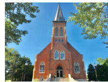
HOLY NAME OF JESUS