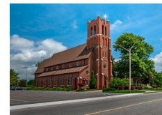
ST. JOHN THE EVANGELIST